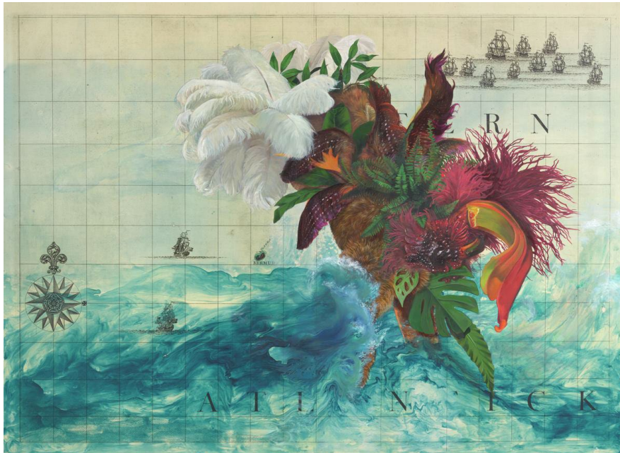
Untitled (A Map of the British Empire in America) 2021

Location: Turbine Hall, Natalie Bell Building, Tate Modern Bankside, London SE1 9TG